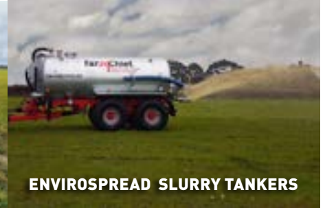
ENVIROSPREAD SLURRY TANKERS