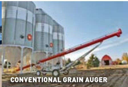
CONVENTIONAL GRAIN AUGER