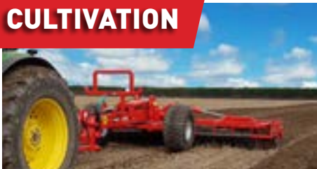
HEAVY DUTY SPEED DISCS