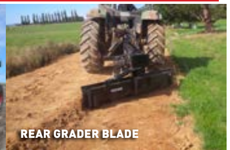
REAR GRADER BLADE