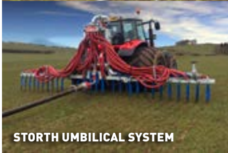
STORTH UMBILICAL SYSTEM