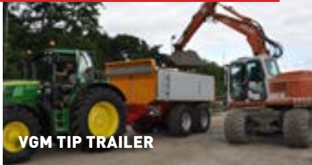
VGM TIP TRAILER