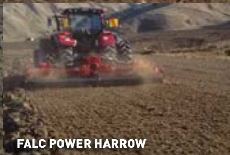
FALC POWER HARROW