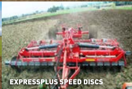
EXPRESSPLUS SPEED DISCS