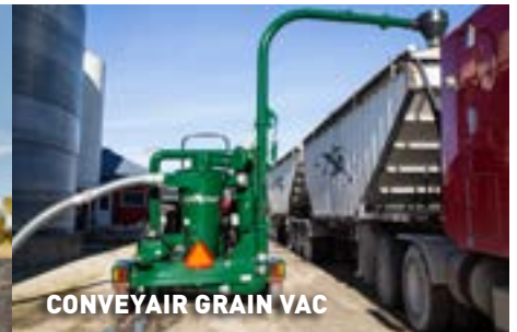
CONVEYAIR GRAIN VAC