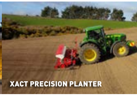
XACT PRECISION PLANTER