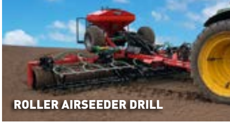
ROLLER AIRSEEDER DRILL