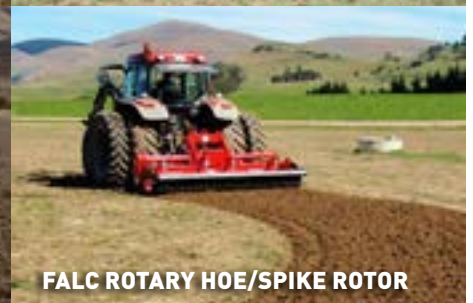
FALC ROTARY HOE/SPIKE ROTOR