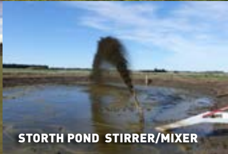
STORTH POND STIRRER/MIXER