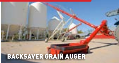
BACKSAVER GRAIN AUGER