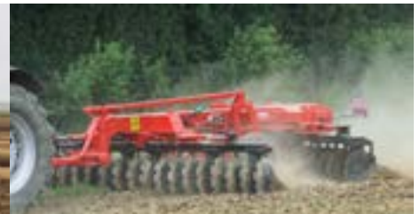
PRIMARY CULTIVATION DISCS