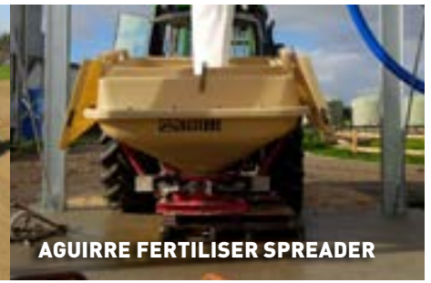
AGUIRRE FERTILISER SPREADER