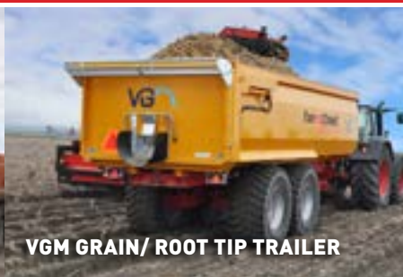
VGM GRAIN/ ROOT TIP TRAILER