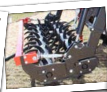
REAR DOUBLE SPIKED ROLLER