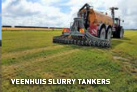
VEENHUIS SLURRY TANKERS