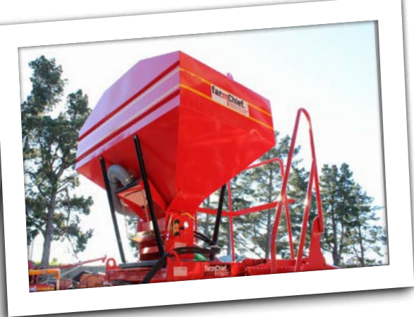
FARMCHIEF SWISS AIRSEEDER